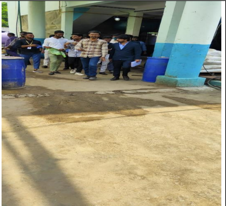
Students visited Nifty -LAB Manufacturing unit